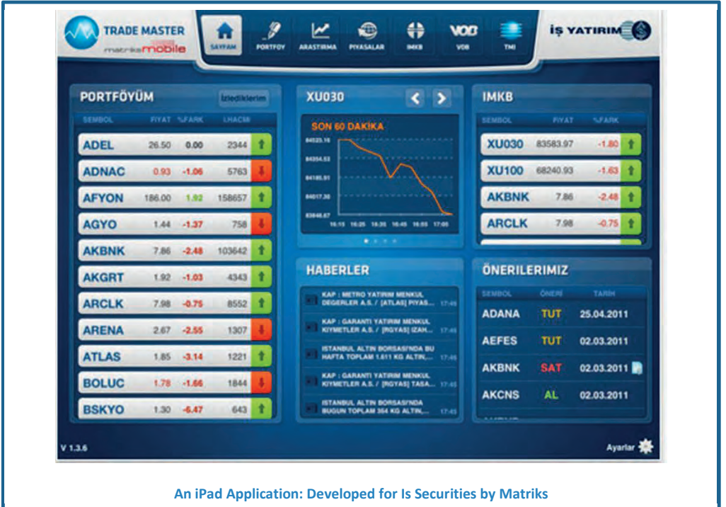
An iPad Application: Developed for Is Securities by Matriks

Matriks clients include: Garanti Bank (and Securities department); Is Bank (and Is Securities); Ak Bank (and Ak Securities); Finans Bank (and Finans Invest); Yapi Kredi Bank and Securities; Eczacibasi Securities; Deniz Bank (and Deniz Securities); ING Bank (and ING Securities); and many more.